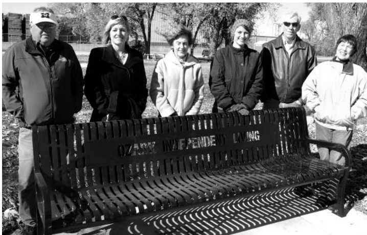
Don Warden Park/Community Garden