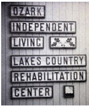
OIL'S first sign and original logo on banner on wall (at right) at open house in 2000.