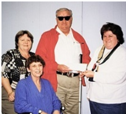
Above right: OIL board members and friends at OIL's first office located in Imperial Center.